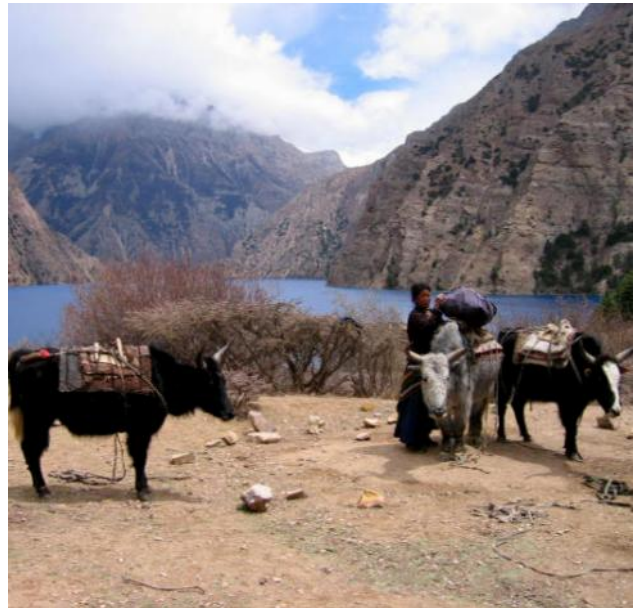
Shey Phoksundo National Park

It was not possible to summarize activities for Bardia NP and Chitwan NP because the management plans did not include activity descriptions that were similar enough across the user committees to understand what the activity entailed. A more detailed understanding of each activity would be needed in order to summarize into broader categories of activities.