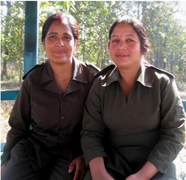
Community forest guards near Chitwan National Park © Teri Allendorf.

similar activity titles, which made it possible to sum the amount spent on specific activities across all of the committees to find total amounts allocated to each type of activity.